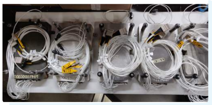
Figure 2 : SOEC stacks manufactured

A set of SOEC unit cells and stacks have been manufactured by Elcogen for detailed characterization to be performed in DTU facilities. The unit cell testing have started and is currently supporting system optimization at DTU. In addition, detailed thermo-mechanical-electrochemical modelling by DTU are currently allowing optimization of system operation. Finally, Elcogen has finished a conceptual design of the SOEC pilot system to be integrated into DK6 power plant.