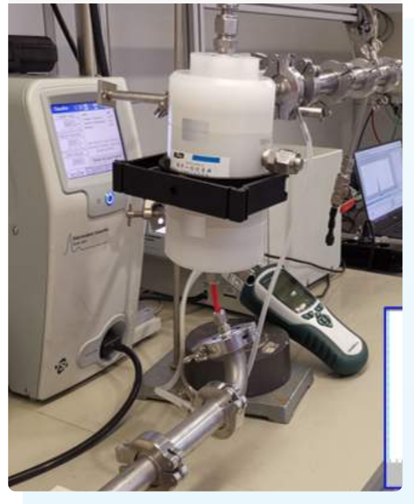
Figure 1: Dust exposure tests on membrane contactor (CNRS)

The design of carbon capture unit dedicated to CO<sub>2</sub> extraction from blast furnace flue gases is currently under progress (CNRS and ENGIE). This design and conception process is supported by dust filtration experiments, solvents inventory and selection, membrane contactor tests on synthetic gas mixtures and design of a mini absorption / regeneration unit to be installed on site at DK6. A series of simulations is simultaneoulsy carried out by CNRS in order to achieve the final design of the carbon capture pilot, based on the CCU specifications (flowrate, purity, trace compounds).