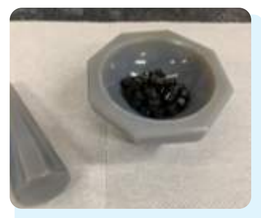
Figure 7 : Catalyst for the methanol synthesis