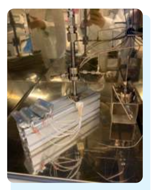
Figure 5 : Reactor for catalyst activity tests

In TU/e, some students are collaborating with the research team, helping in getting interesting results for the development of efficient membrane reactors for DME production: (i) Gaia Basile is testing membranes developed by Tecnalia for water/methanol permeation, (ii) Deniz Etit has designed the first route for the separation section for the DME direct synthesis, (iii) Alessandro Gazzola is designing the conventional process and the membrane reactor based one in order to compare the performances, (iv) Danny Helwegen has implemented a model from literature to study the effect of operating conditions on the capillary condensation phenomenon