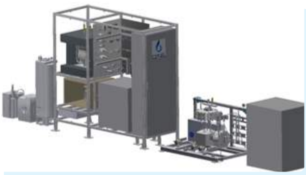
Figure 4:3D view of C2FUEL SOEC pilot

Figure 3 : CFD modelling and simulations of SOEC stacks